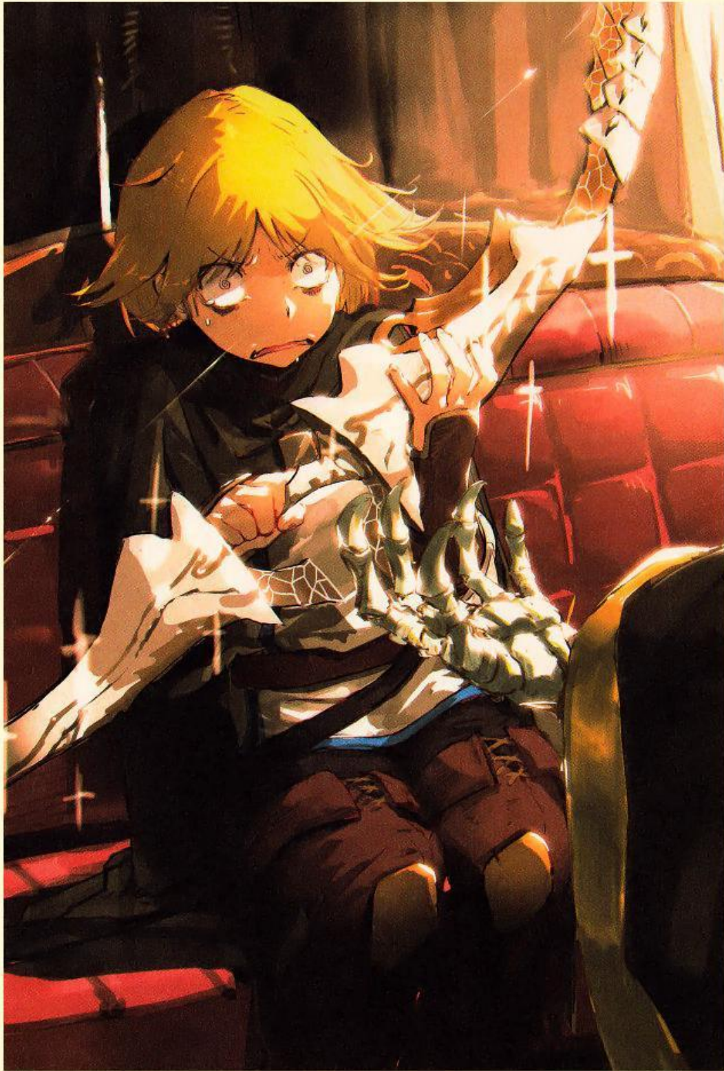
OVERLORD [2] The paladin of the Holy kingdom