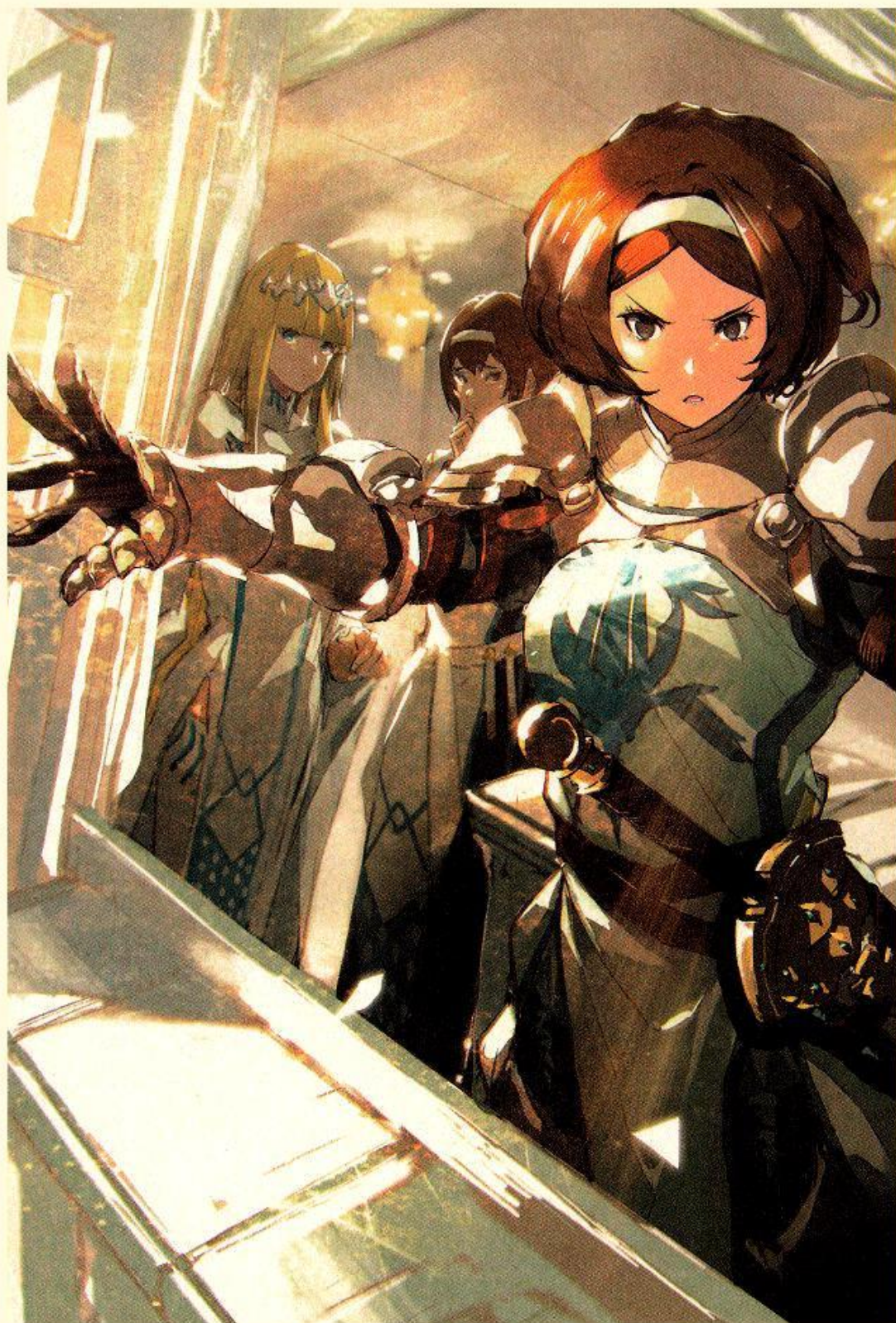
OVERLORD [2] The paladin of the Holy kingdom